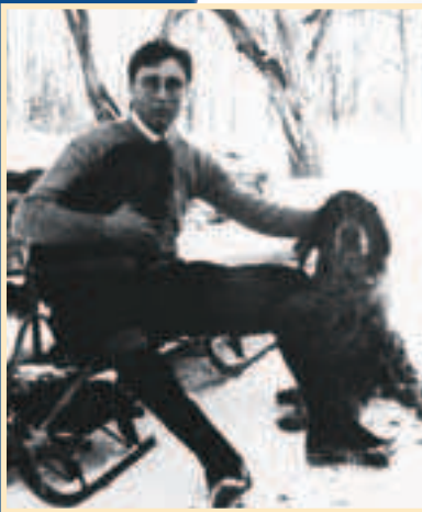
Franklin D. Roosevelt as a young man